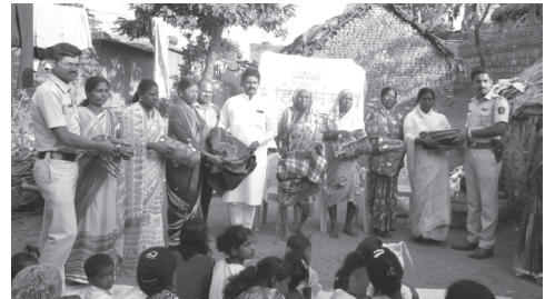
Tribal friends pose for a photo following the blanket distribution.

distribution programme on 23 January 2018 which was attended by as many as 30 children and 90 men and women. The purpose was to help the poor take care of their health during the winter season. The guests Shri