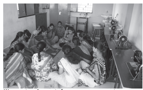
Women at work as part of women empowerment programme

The tailoring class in which 16 women participated had been