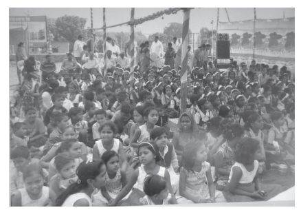
Girl participants in the magic and yoga performance

Around 500children attended a grand gettogether at Bakori on 17 November 2017 where they not only enjoyed a magic show but also learnt writing poetry and doing yoga. The guests Hanumant Chandgude, Prakash Shirode and Khandekar respectively regaled the children with